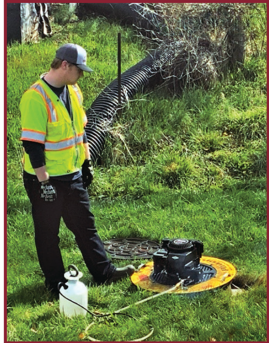
SMOKE TESTING - Introducing organic smoke into system via manhole