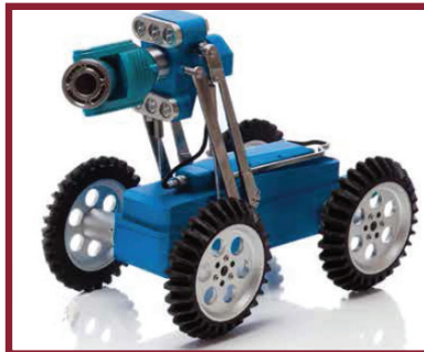
CCTV (Closed Circuit Television) INSPECTION