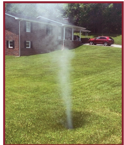
SMOKE TESTING - Broken Cleanout Cap